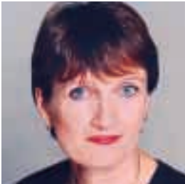
Rt. Hon. Tessa Jowell MP Secretary of State for Culture, Media and Sport