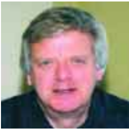
Michael Grade OBE Chair Camelot Group plc