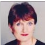
Rt Hon Tessa Jowell, MP Secretary of State for Culture, Media & Sport